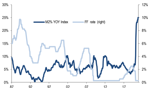
US Money Stock (M2, y/y), FF Rate